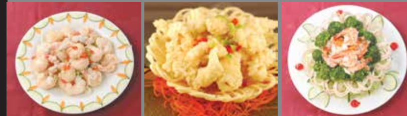
38. Crisp Shrimp w/ Spicy Seasonings 42A. Dry Vancouver Calamari 39. Chicken & Shrimp in a Nest

Indicates Hot & Spicy Indicates Nuts & Peanuts