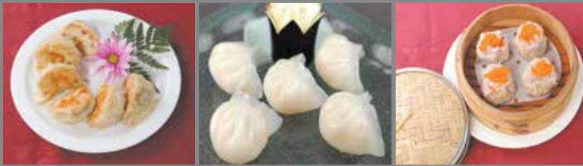
8. Pan Fried Meat Dumplings 12. Haw Gaw 13. Shiu Mar