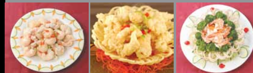
38. Crisp Shrimp w/ Spicy Seasonings 42A. Dry Vancouver Calamari 39. Chicken & Shrimp in a Nest

Indicates Hot & Spicy Indicates Nuts & Peanuts