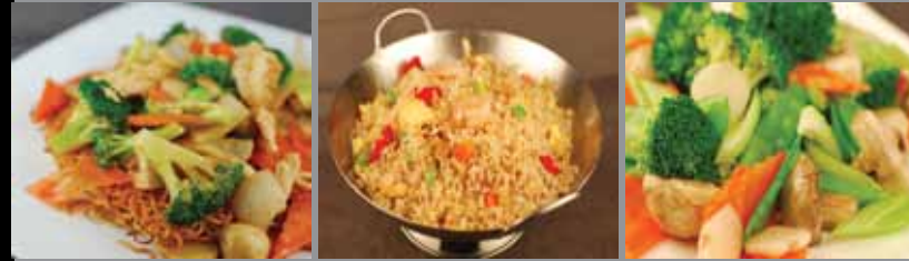
87. Cantonese Chow Mein 91. House Special Fried Rice 74. Chengtu Mixed Vegetables