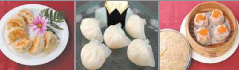
8. Pan Fried Meat Dumplings 12. Haw Gaw 13. Shiu Mar