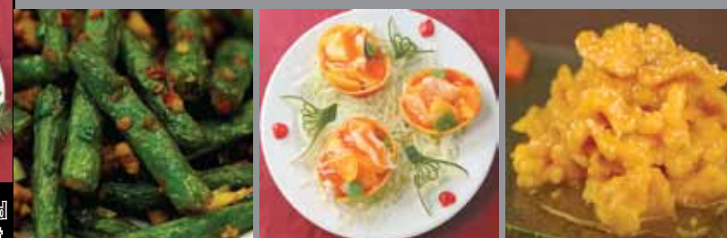
36A. Dry Fried Green Bean 46A. Fresh Mango Chicken 51B. Lemon Chicken HK Style