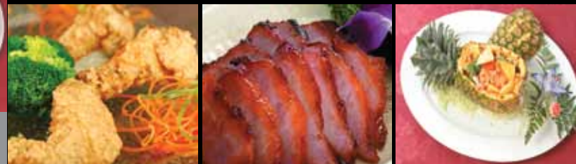
19. Golden Crispy Wings 32. B.B.Q. Pork 38A. Sauteed Chicken served in a Fresh Pineapple Boat