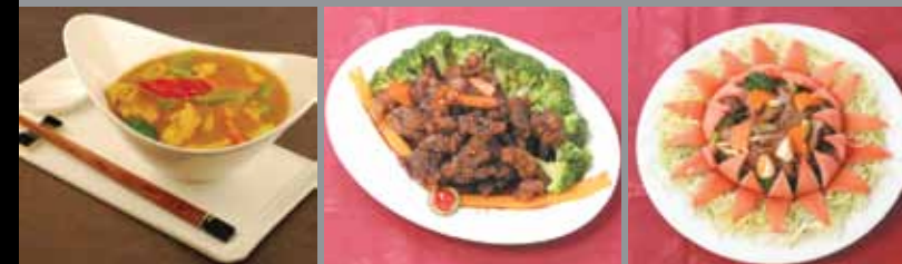
41. Curried Chicken 58. Crispy Beef in Orange Peel Sauce 62. Beef with Broccoli

Indicates Hot & Spicy Indicates Nuts & Peanuts